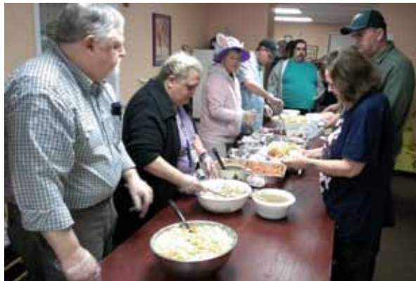
Stepping Stone Drop-In Center celebrates Easter by putting on a great buffet.

Provides a range of recovery-orientated mental health treatment services and support to adults with mental illness.