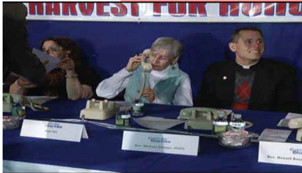
Harvest For Hunger Telethon 2012.