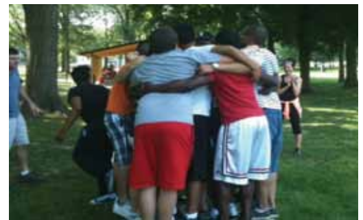
A Youth Adventure Leadership Program group hug.