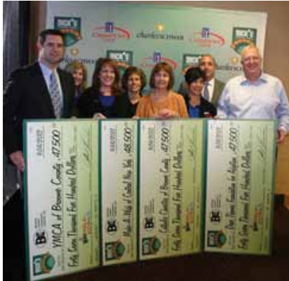
YOU helped us raise over $190,000 for Wendy's Walk for Kids 2012!!