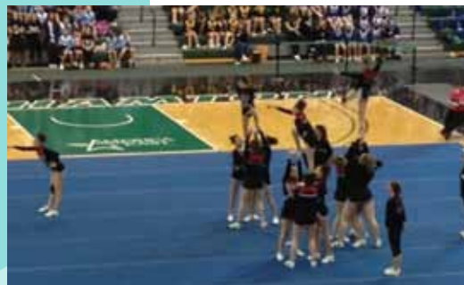
CYO cheerleaders show their spirit at the Cheerleading Competition at the BU Events Center.