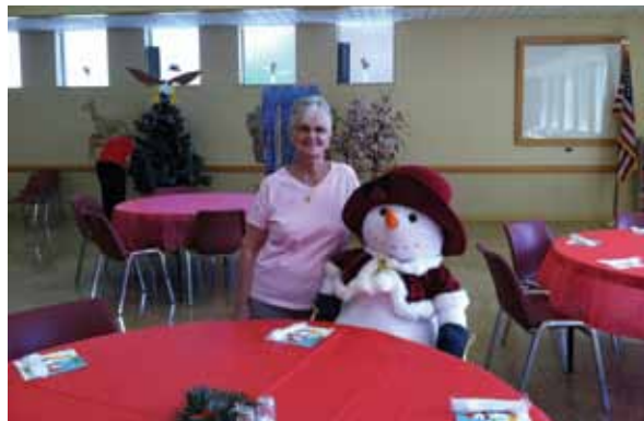
RSVP and Friends.