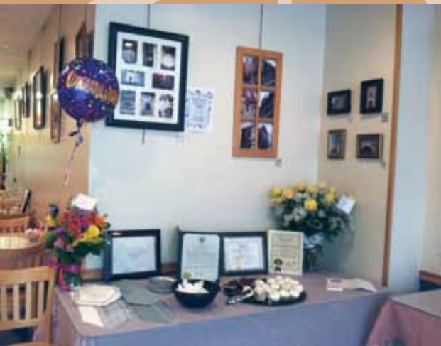
Portfolio's Café celebrates 25 years!