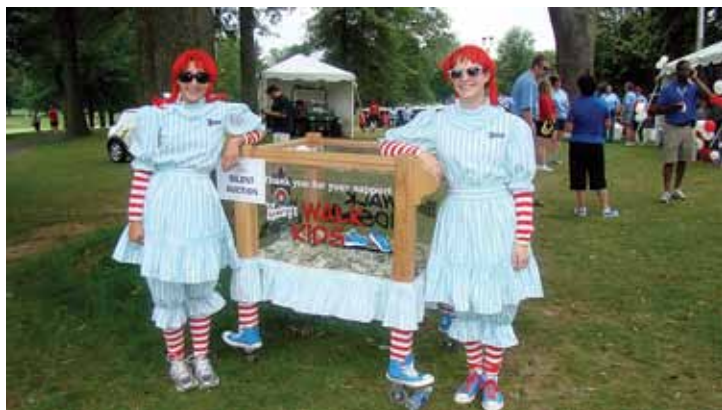
Wendy's Walk for Kids supported Catholic Charities youth services.

“Rooted in Tradition, Building for People of All Faiths”