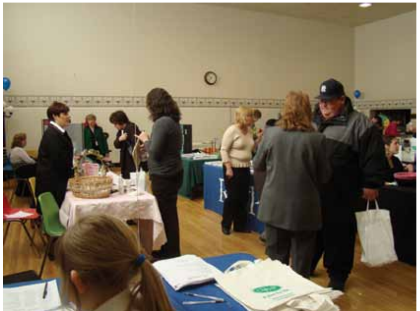
The Special Events Committee sponsors a Staff Wellness Fair.