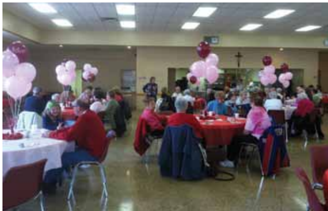
Oak Street Senior Center Fun.