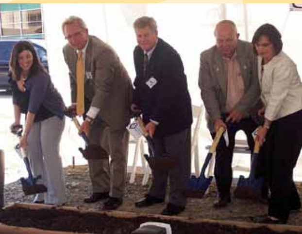
2011 Groundbreaking Ceremony for our new Headquarters.

During 2012, the addition was completed in August with staff moving over from the existing building. We give thanks for the many donors who have believed in and invested in the future of Catholic Charities. As we prepare for the opening, we continue in our quest to secure the remaining funds by launching Capital Campaign Phase 2 in 2013. We look forward to the future as we continue to open our doors to the most vulnerable of our community.